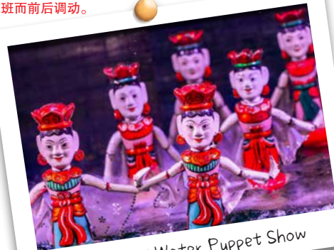
水上木偶 / Water Puppet Show