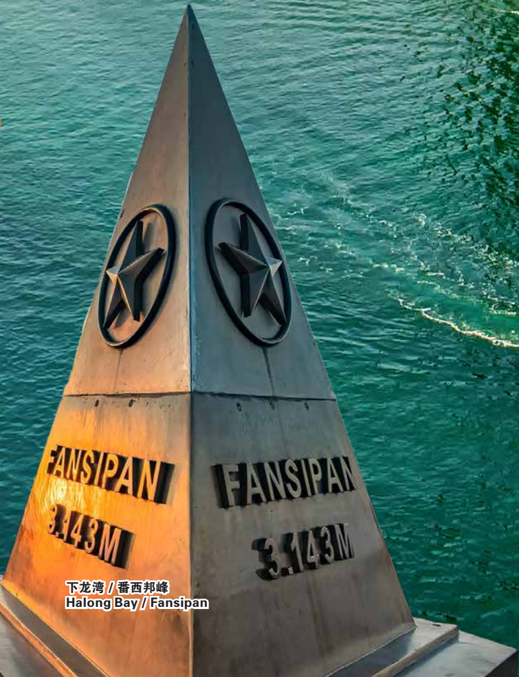
下龙湾 / 番西邦峰 Halong Bay / Fansipan

河内 | 下龙湾 | 宁平 | 沙坝 HANOI | HALONG BAY | NINH BINH | SAPA