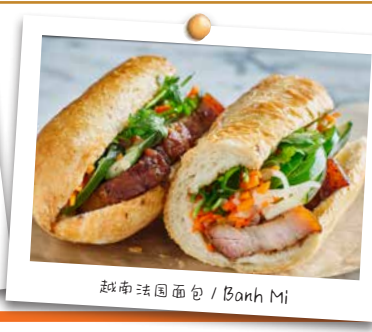
越南法国面包 / Banh Mi