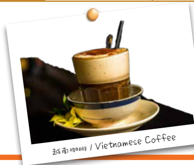
越南咖啡 / Vietnamese Coffee