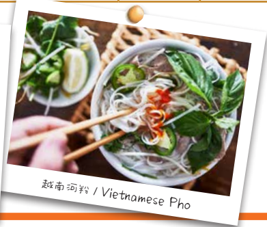
越南河粉 / Vietnamese Pho