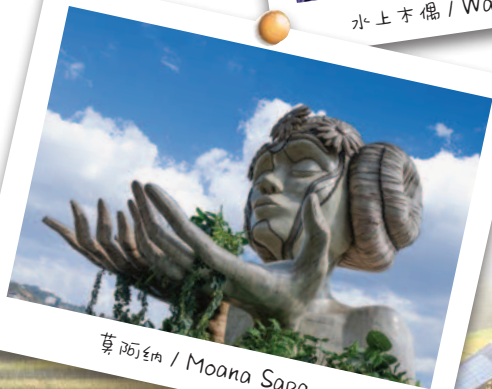
莫阿纳 / Moana Sapa